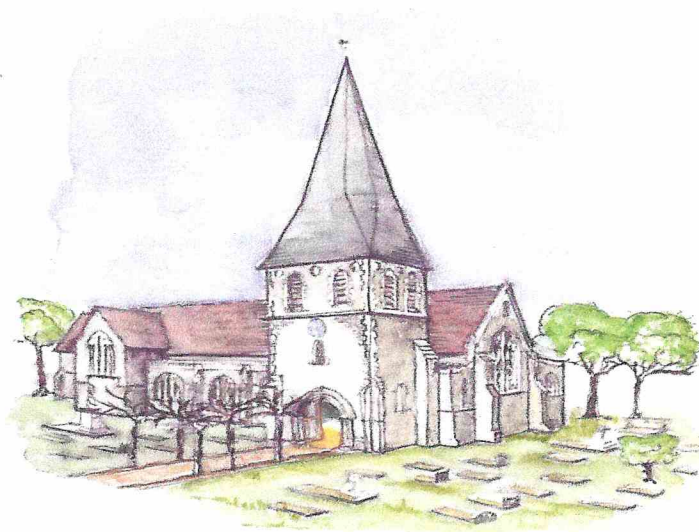
St Peter's Church Hershham

Parochial Church Council's Report and Unaudited Accounts for the year ended 31 December 2022