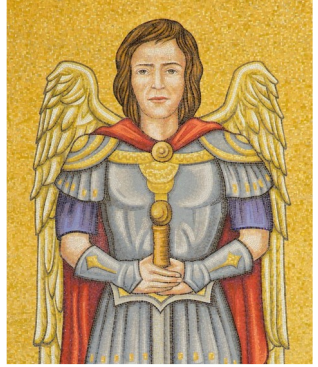
St. Michael and All Angels

A very warm welcome to St. Peter's Church