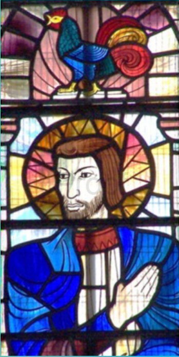
St. Peter's Church, Hersham